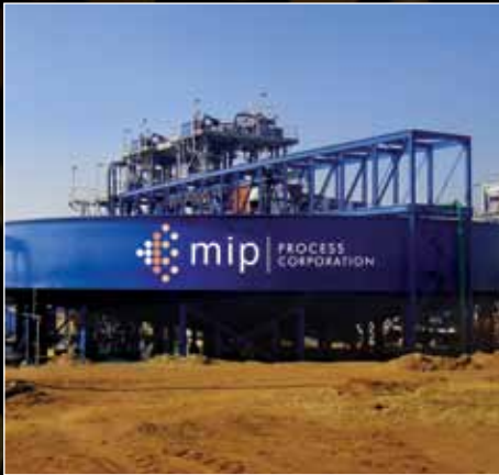
85ft \Phi Thickener in operation