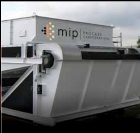
325ft 2 Linear Screen