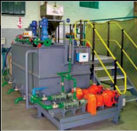
MIP-200 Flocculant Plant