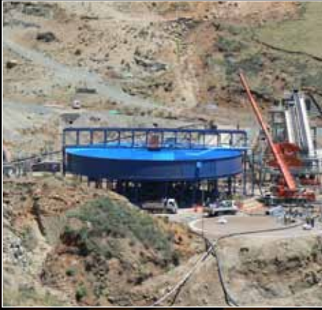
100ft \Phi Thickener